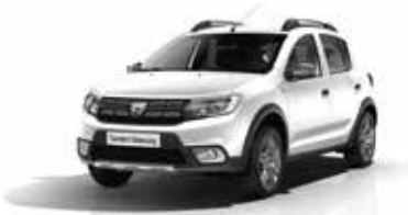
Glacier White (369)