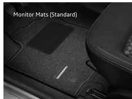
Monitor Mats (Standard)