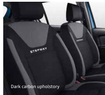
Dark carbon upholstery