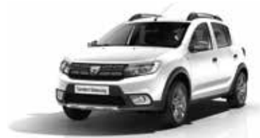
Glacier White (369)