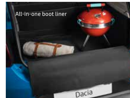
All-in-one boot liner