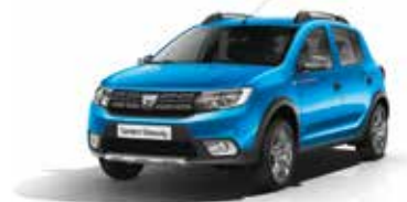
Azurite Blue (RPL)