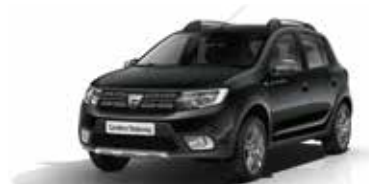
Slate Grey (KNA)