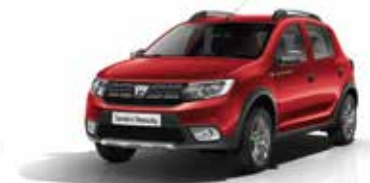
Cinder Red (B76)