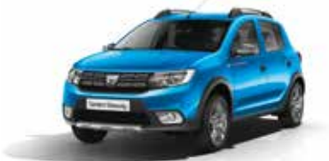
Azurite Blue (RPL)