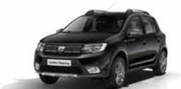
Slate Grey (KNA)