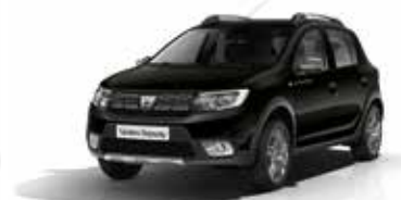
Pearl Black (676)