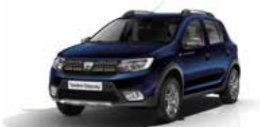
Cosmos Blue (RPR)