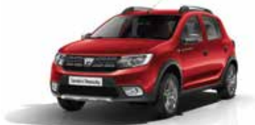
Cinder Red (B76)