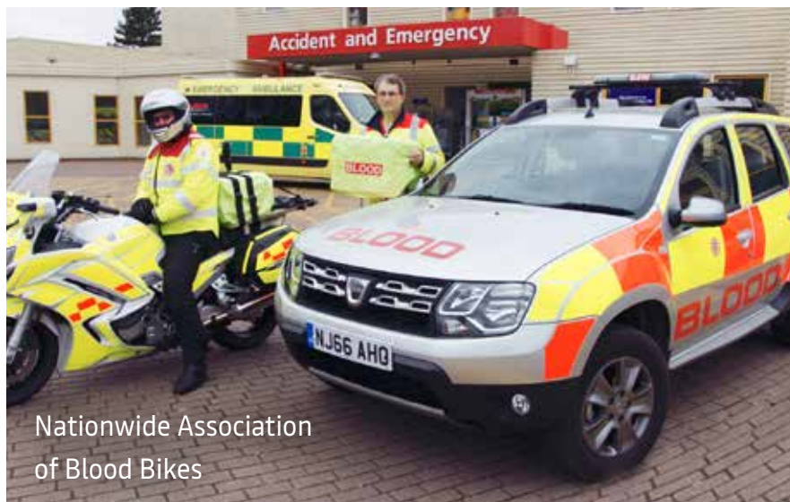
Nationwide Association of Blood Bikes