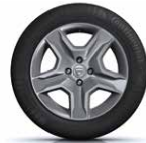
16" "Stepway" design wheels