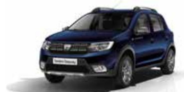
Cosmos Blue (RPR)