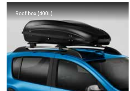
Roof box (400L)