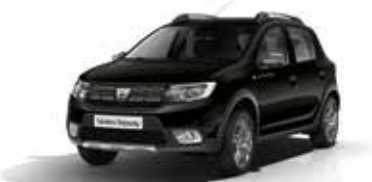
Pearl Black (676)