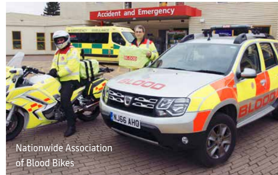
Nationwide Association of Blood Bikes