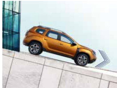
HILL DESCENT CONTROL*