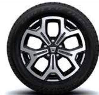
17" 'DIAMOND-CUT' ALLOY WHEEL