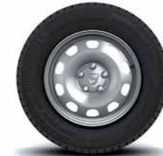
16" STEEL WHEEL