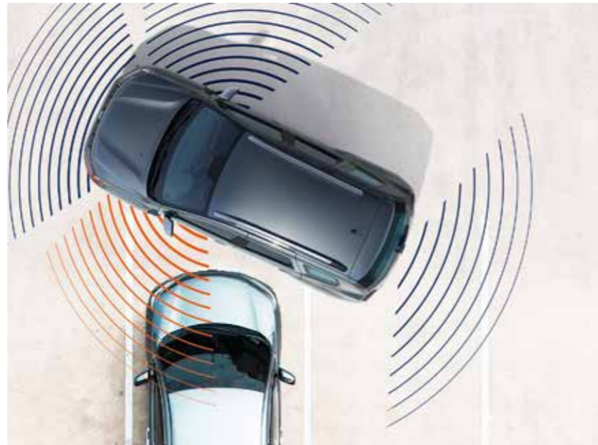
MULTIVIEW CAMERA ^