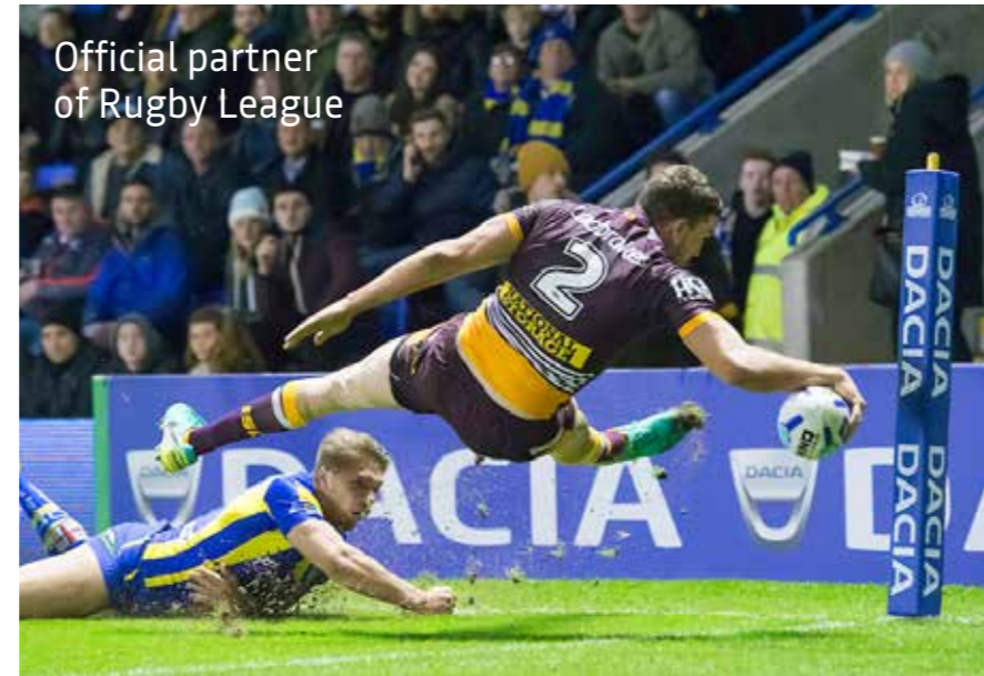
Official partner of Rugby League

For us, going the extra mile doesn't stop at making great value cars. We take great pride in playing an active part in the community and giving back to communities throughout the UK. We support the life-saving work of the Nationwide Association of Blood Bikes . We get stuck in as the official partner of Rugby League . Now the proud sponsors of the Nation England Rugby League teams for Men, Women, Wheelchair and Youth. We also run Dacia Days , which are full of fun and games for our amazing Dacia drivers - keep an eye out for the next event! In the meantime, keep up with us on our Facebook page, Youtube Channel or Instagram.