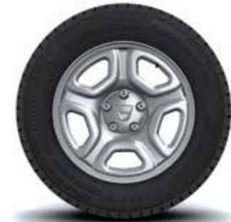
16" 'FIDJI STYLED' WHEEL