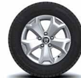
16" 'CYCLADE' ALLOY WHEEL